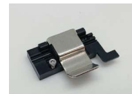
Single Fiber Adapter