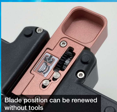
Blade position can be renewed without tools