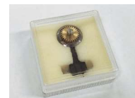
Blade Exchange Set (Optional component)