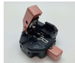
S327 Main Body

*4 If parts other than Blade, such as the Rubber pad, are worn out, replacing Blade alone may not restore the initial performance.