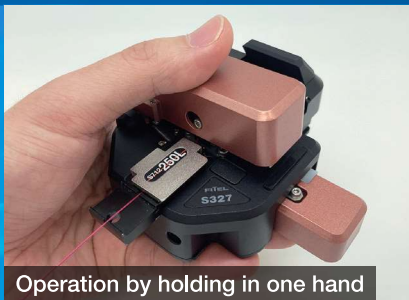
Operation by holding in one hand